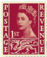
The three Welsh stamps from the miniature sheet issued in 2008 for the 50th anniversary of Country stamps. The leek and dragon are symbols long associated with Wales.

Named in his honour, St David's Cathedral now stands on the site of the original monastery. David is thought to have died on 1 March 589, and is buried at the Cathedral ensuring that this would be an important place of worship for generations to come. From the 12th century onwards, 1 March became a national saint's day – a time for celebration and feasting. David now took his rightful place alongside contemporaries of the British Isles – Saints George, Andrew and Patrick.